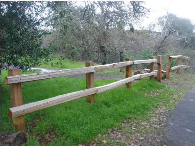
Split rail design consistent with neighboring open space, provides pedestrian, horse and maintenance access