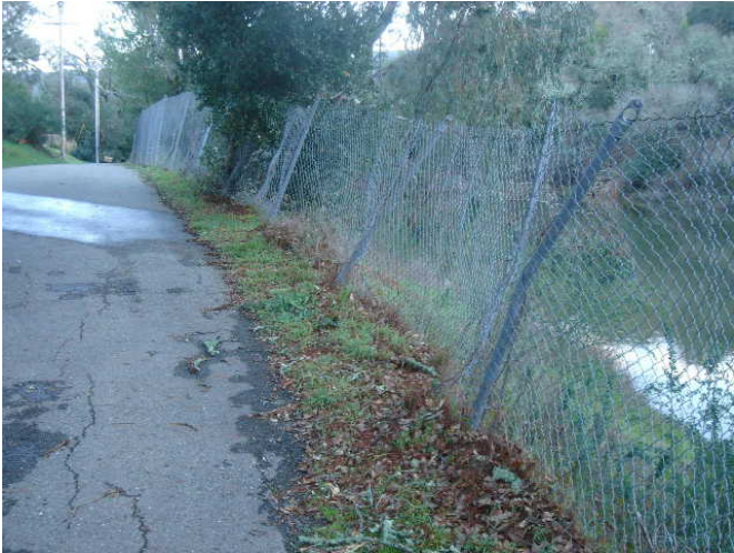
Fence damaged by vehicles