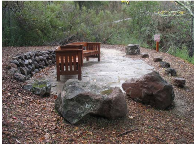
Viewing area created Dec. 2008. Area previously overgrown with Coyote brush and broom