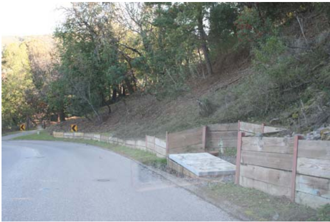
Clear back from Roadway