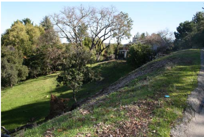
Clear back from roadway