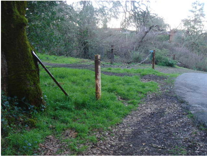
Cable and bollards, trip hazard, unsightly