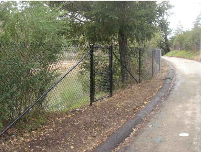
New fence with protective Curb