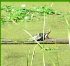
Western Pond Turtle